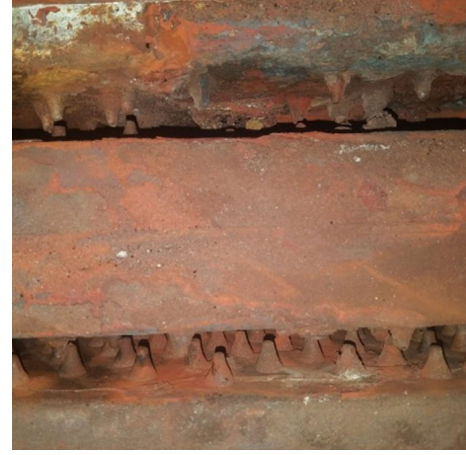
Corrosion above the waterline