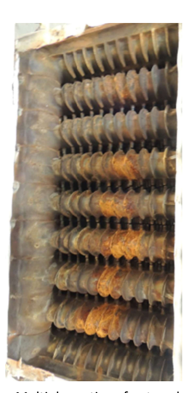
Multiple sections fractured